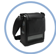
Inogen One G5 Carry Bag* Item #CA-500