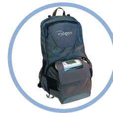
Inogen One G5 Backpack** Item #CA-550