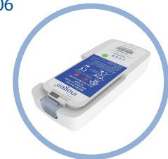
Inogen One G5 Lithium Ion Battery* Up to 6.5 hours run time Item #BA-500