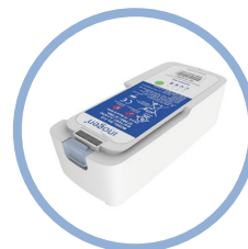
Inogen One ® G5 Extended Life Lithium Ion Battery** Up to 13 hours run time Item #BA-516