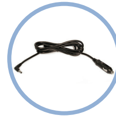
Inogen One G5 DC Power Cable* Item #BA-306